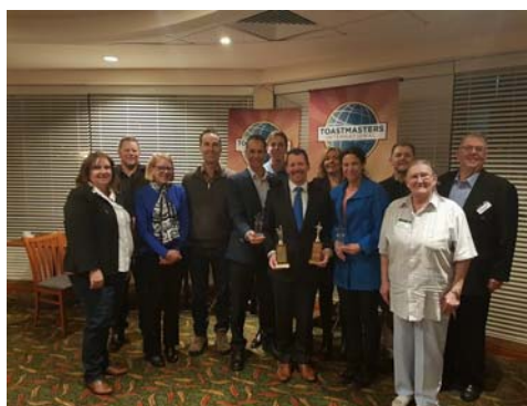
Miranda Toastmasters' cheer squad

BSB: 062-016 A/C #: 00906615 (Remember to include your name)